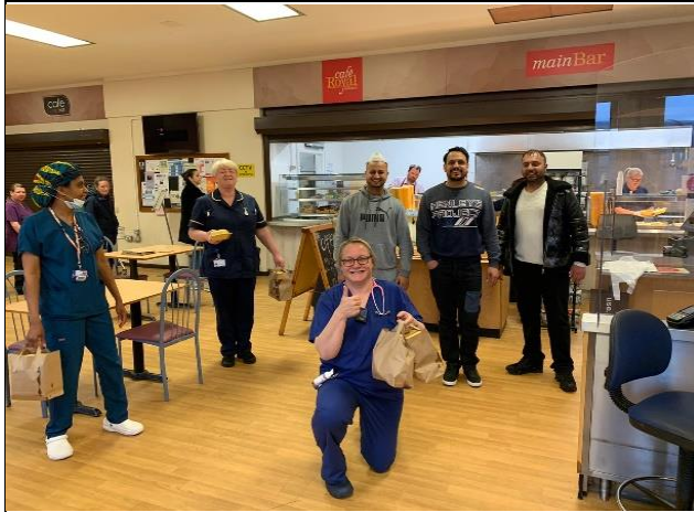
hot meal sponsored by Hussainia Islamic Mission Oldham Royal Hospital